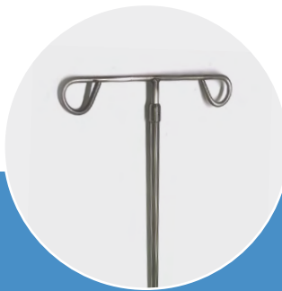
Stainless steel I.V. pole.