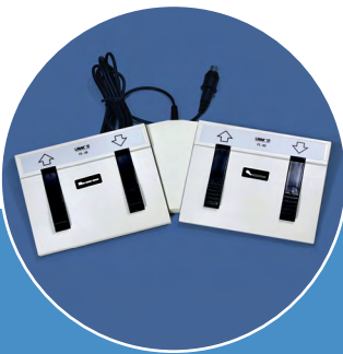
Single, double or triple foot controller available for hands-free patient adjustment.