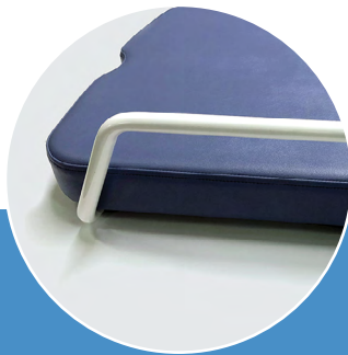
Fixed (at the head) or retractable (at the foot) transport handles are available for easy maneuvering of the exam table.