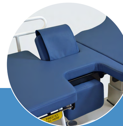
Positioning cushion in the long section on the right side with cardiac cutout on the left side.

Maximum weight capacity: 205 kg / 450 lb using hospital-grade electrical components. 120V - 3.9 AMP - 60 Hz.