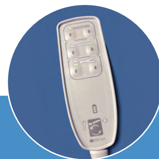
Backlit hand controller.

Entirely designed and manufactured in Canada, locally manufactures offers you easy access to spare parts and customer service in English and French.