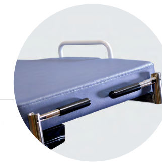
Help patients move themselves on the exam table during positioning.