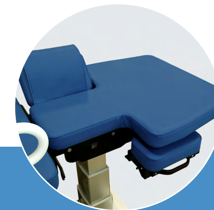
Positioning cushion in the back section on the right side with cardiac cutout on the left side.