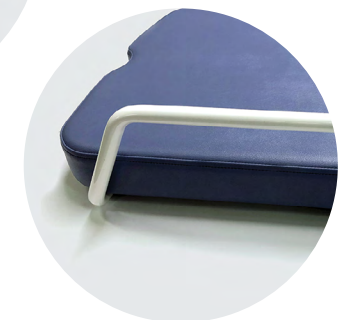
Fixed or retractable transport handles are available for easy maneuvering of the exam table.