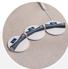
Foot control* Height, fowler, Trend and rev. Trendelenburg positioning.