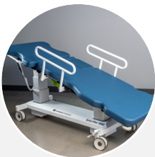
Trendelenburg or reverse Trendelenburg ± 15°

The vinyl upholstery is tested for common cleaning products used in hospitals and clinics 1 , which is imperative when infection control is a priority.