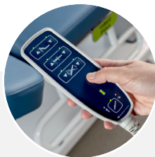
Easy-to-use backlit hand control