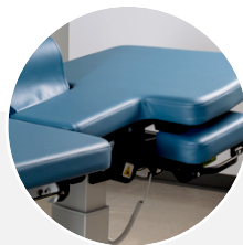
Cardiac cutout* and positioning cushion on backrest