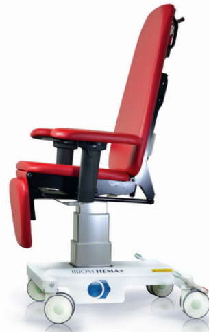
HEMA+ Model Adjustable armchair offering the Emergency Trendelenburg position, central lock and much more.