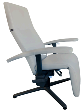
INO CURA Model with XL arm, suitable for treatments, such as blood sampling and vaccinations.