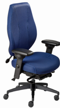
AirCentric 2 Several models available according to your needs.