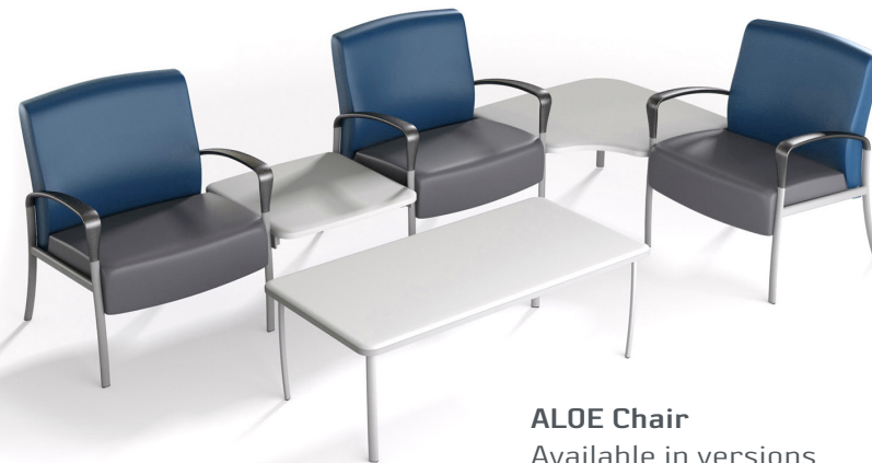
ALOE Chair Available in versions 21", 24" or 30" wide.